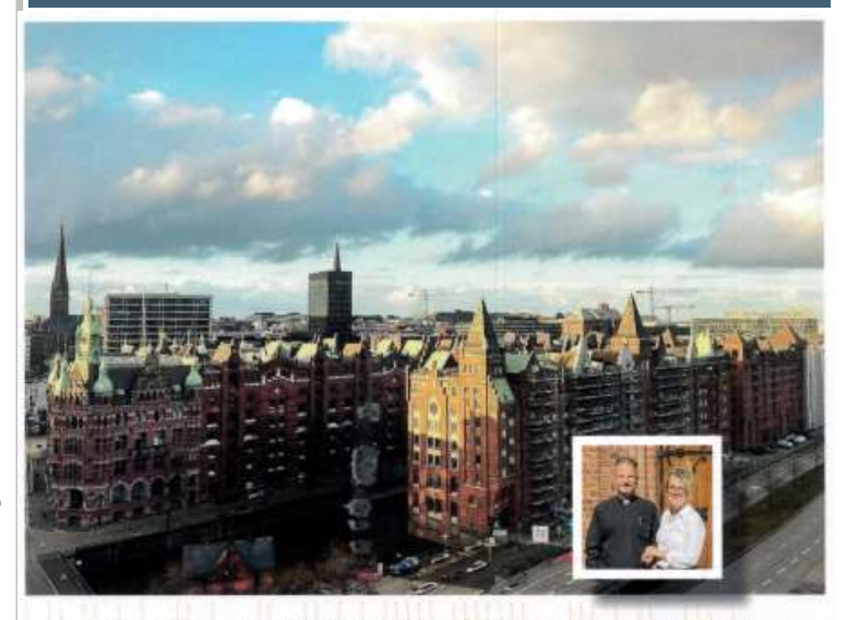
Thank you for supporting our Gospel outreach to Iranians in Germany!