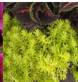
sedum lemon coral