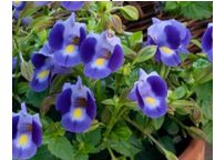
blue moon torenia