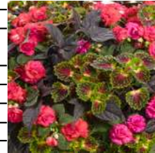
Ace of Spades